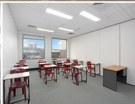
Suite 1.01/ 12 Butler Road, HURSTVILLE