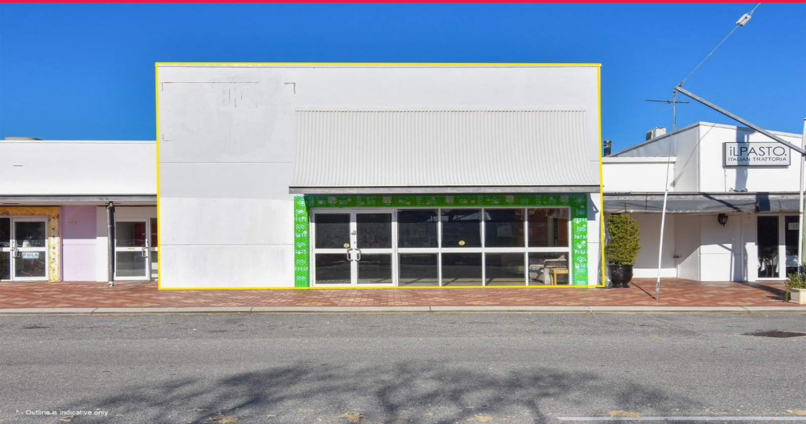
Outline is indicative only