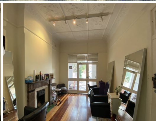
8 Ormonde Parade, HURSTVILLE