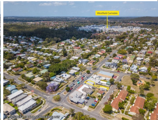
OUTLINES & LOCATIONS INDICATIVE ONLY

135 Winstanley Street, Carina Heights QLD 4152