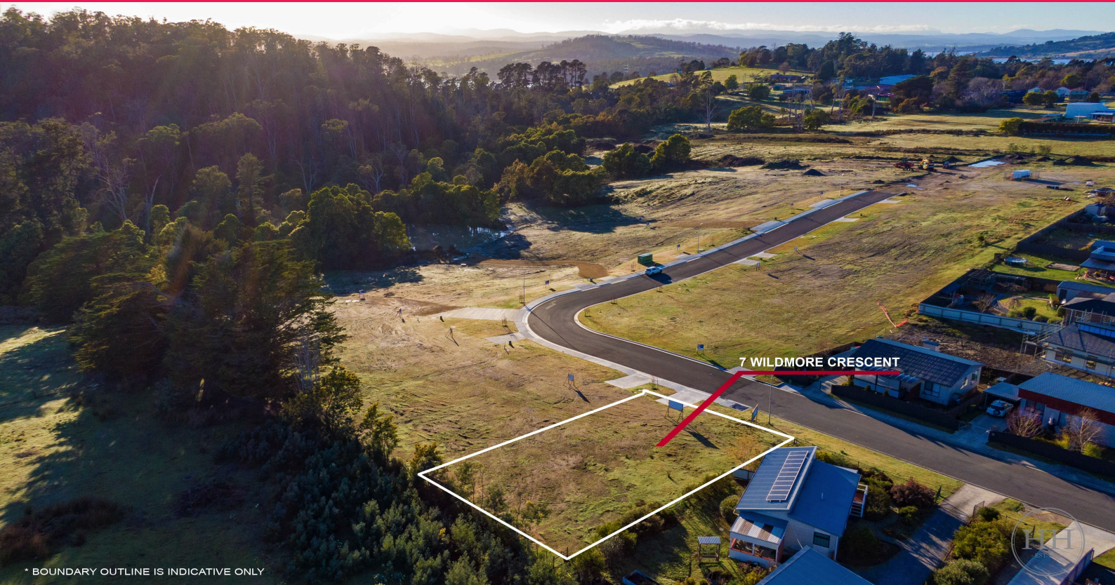
* BOUNDARY OUTLINE IS INDICATIVE ONLY