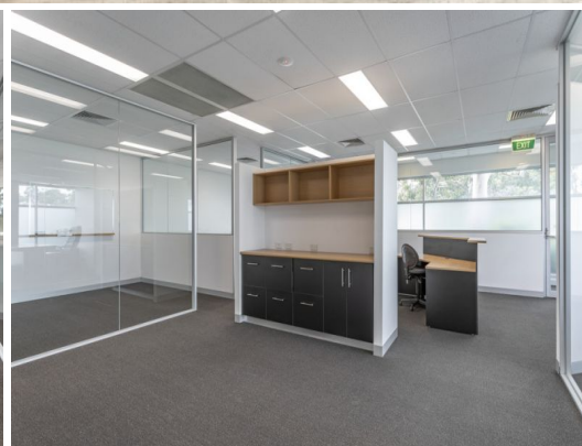
7A/56 NORCAL ROAD, NUNAWADING