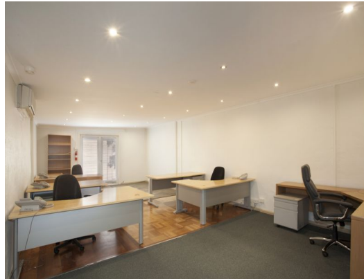
36 Raymond Street, Blackburn North