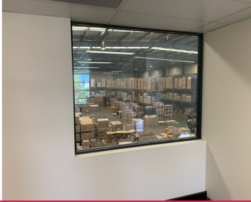
2/17 Baile Road, Canning Vale WA 6155