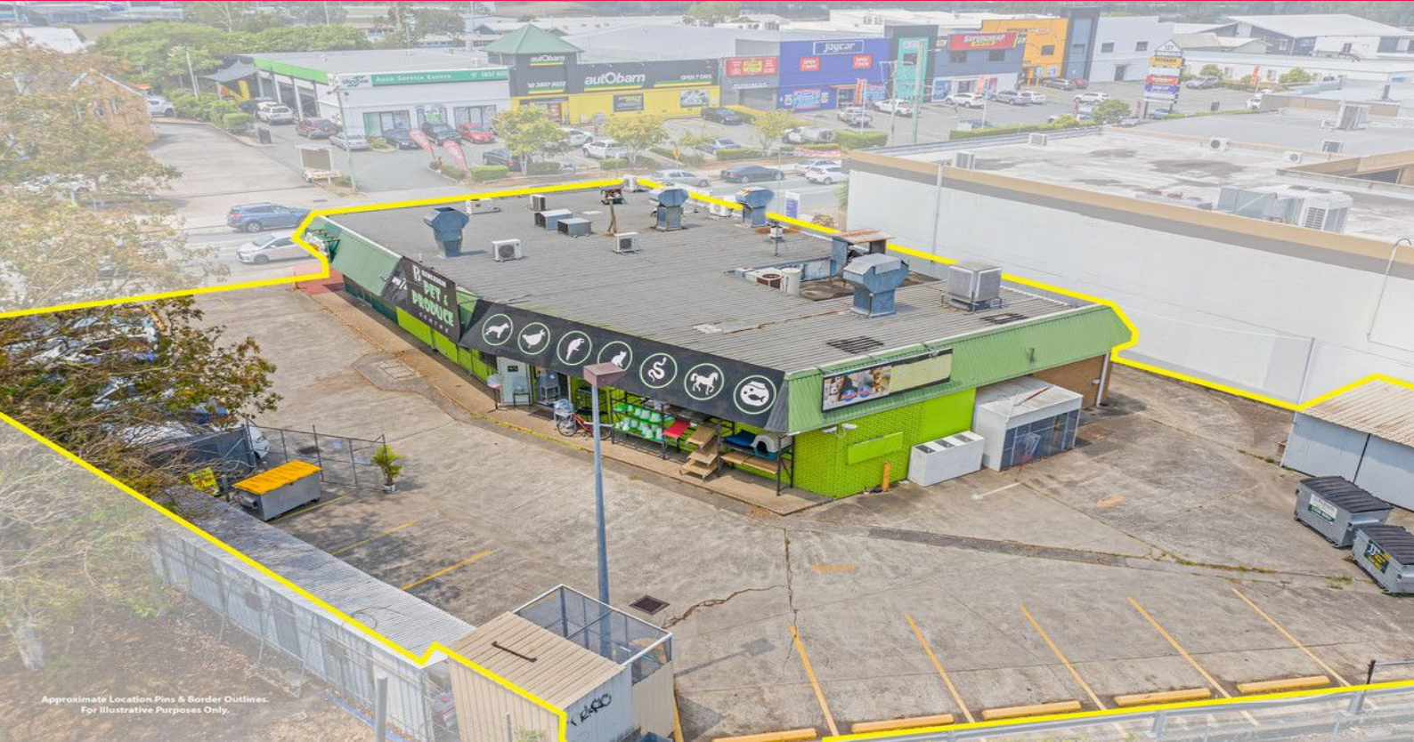
Approximate Location Pins & Border Outlines. For Illustrative Purposes Only.