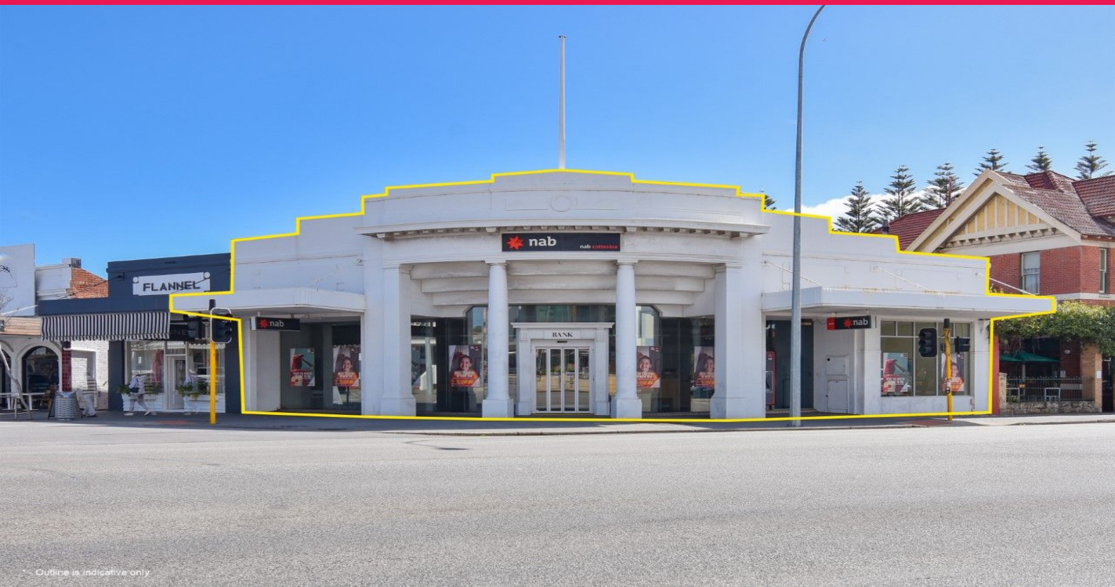
Outline is indicative only