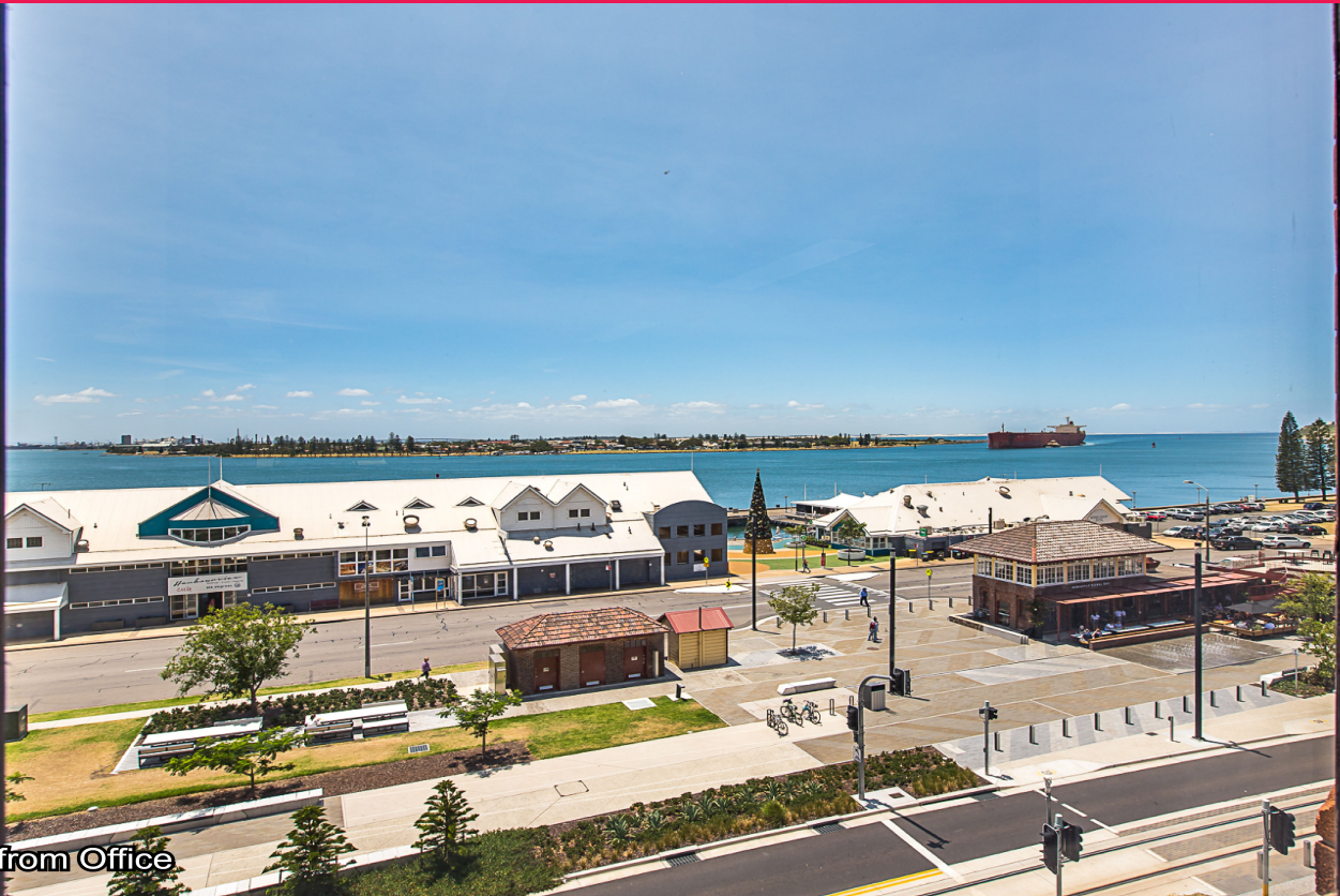
View from Office