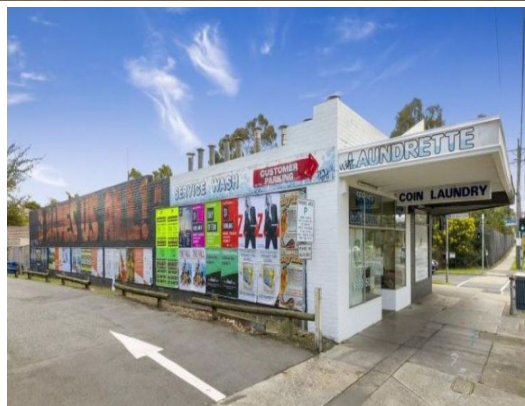
552 WARRIGAL ROAD, MALVERN EAST