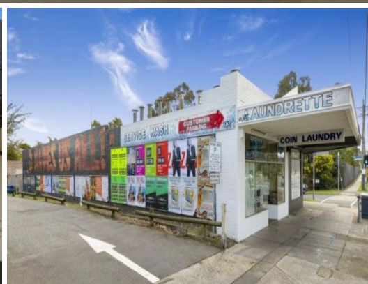
552 WARRIGAL ROAD, MALVERN EAST