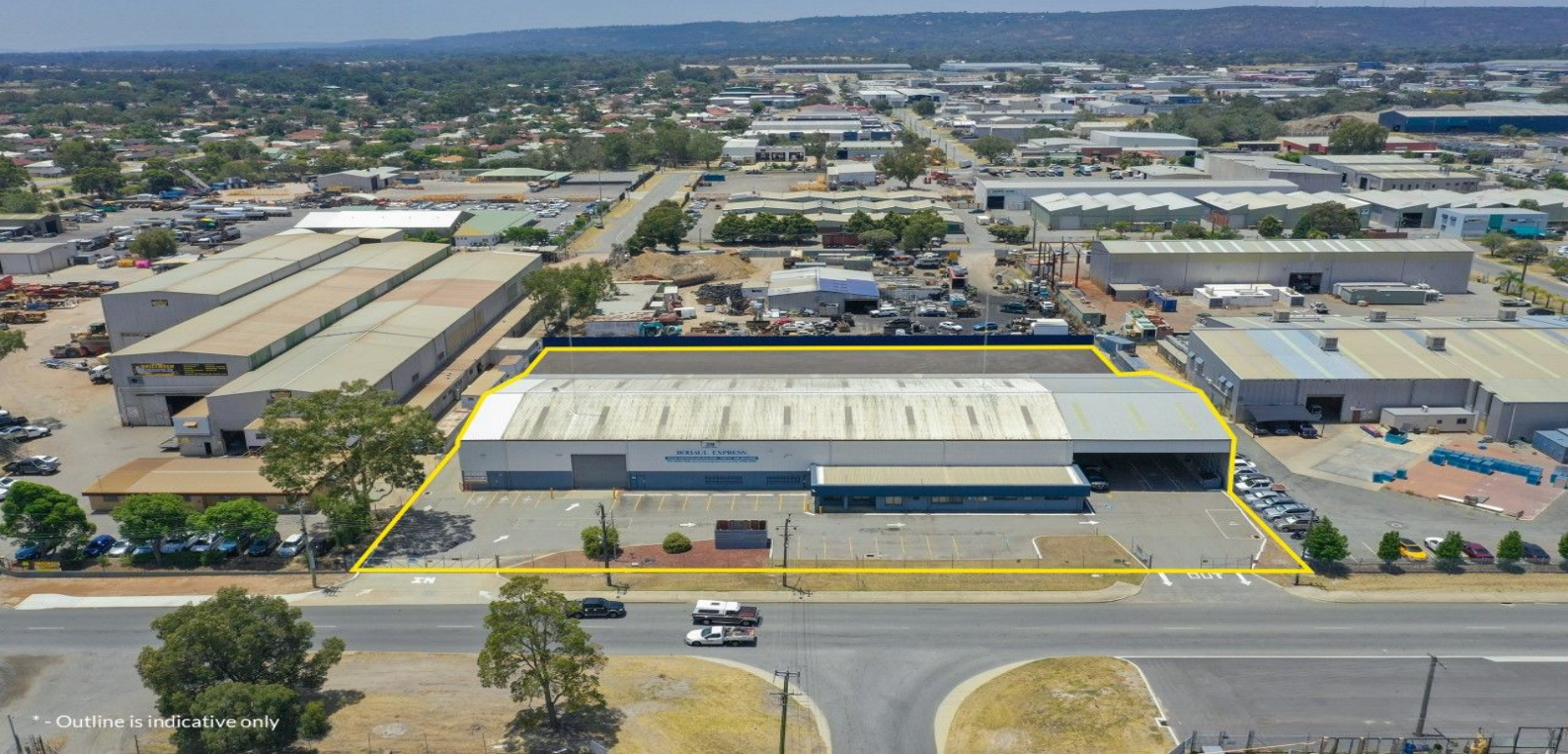
* - Outline is indicative only