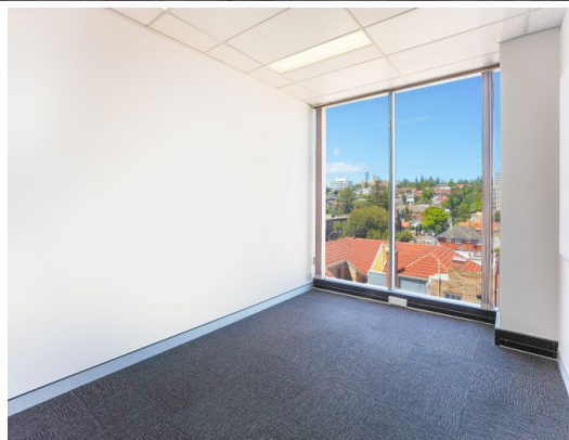
Suite 21/22 Darley Road, Manly