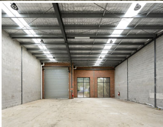
1/6-8 EASTSPUR COURT, KILSYTH