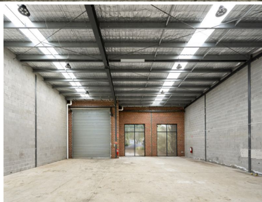
1/6-8 EASTSPUR COURT, KILSYTH