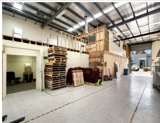
17/5 SAMANTHA COURT, KNOXFIELD