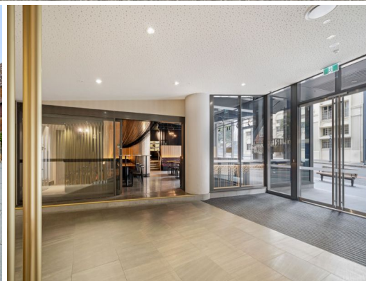
451-457 Ann St, Brisbane

Whilst every attempt has been made to ensure the accuracy of the floorplan contained herein, measurements of doors, windows, rooms and any other items are approximate and no responsibility is taken for any errors, omissions or misstatements. Source: Blueprints are not in position. This plan is for illustrative purposes only and should be used as such for any prospective purchase.