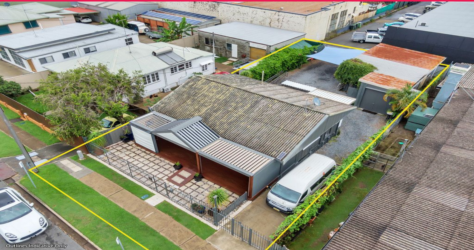
Outlines Indicative Only