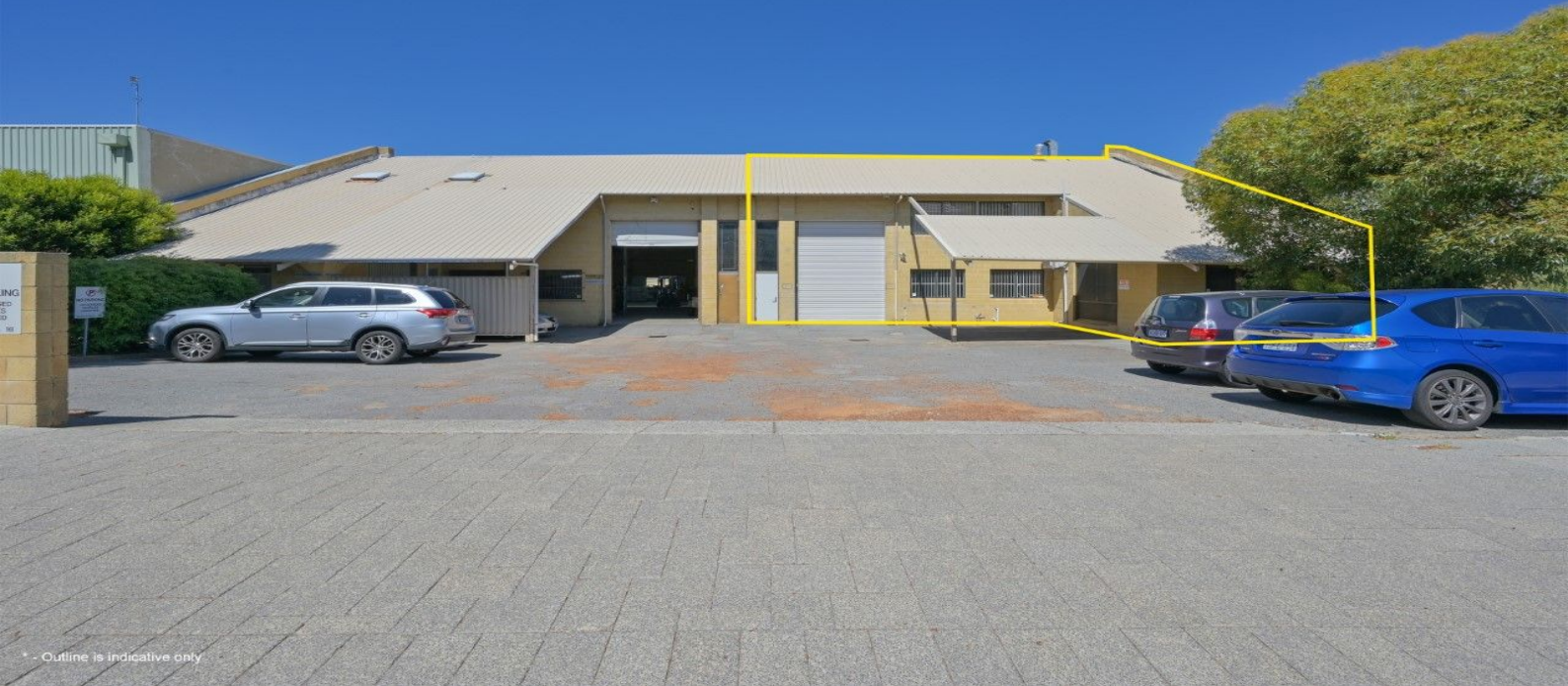
* Outline is indicative only