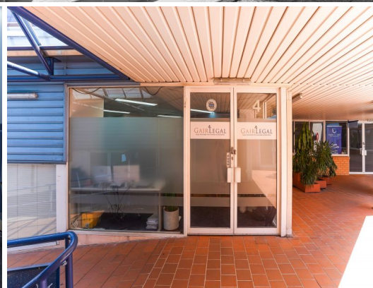
4/26 Fisher Road, Dee Why NSW 2099