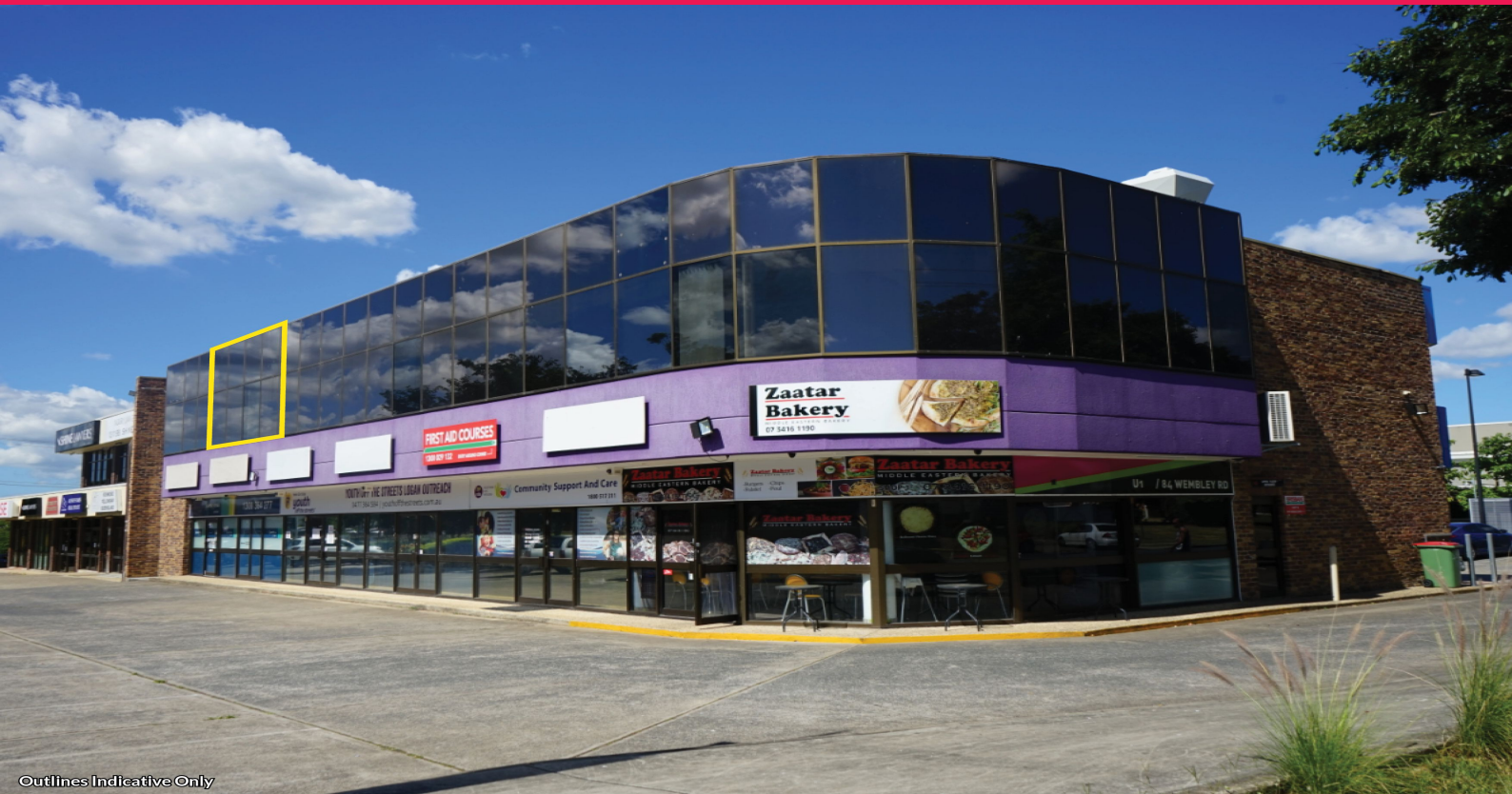
Outlines Indicative Only