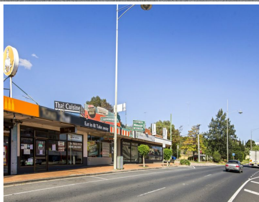
188 BULLEEN ROAD, BULLEEN