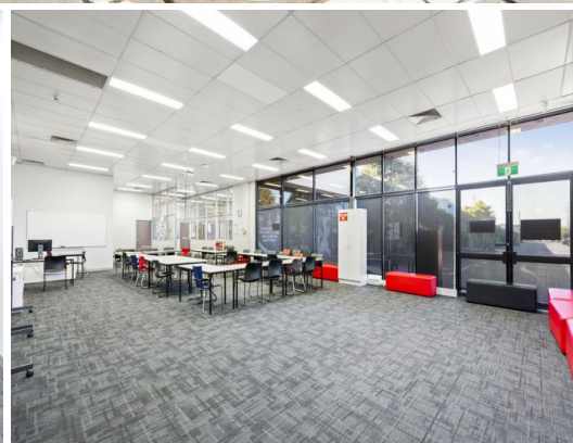
A-B/126 SPRINGVALE ROAD, SPRINGVALE