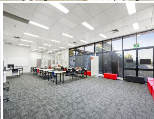
A-B/126 SPRINGVALE ROAD, SPRINGVALE