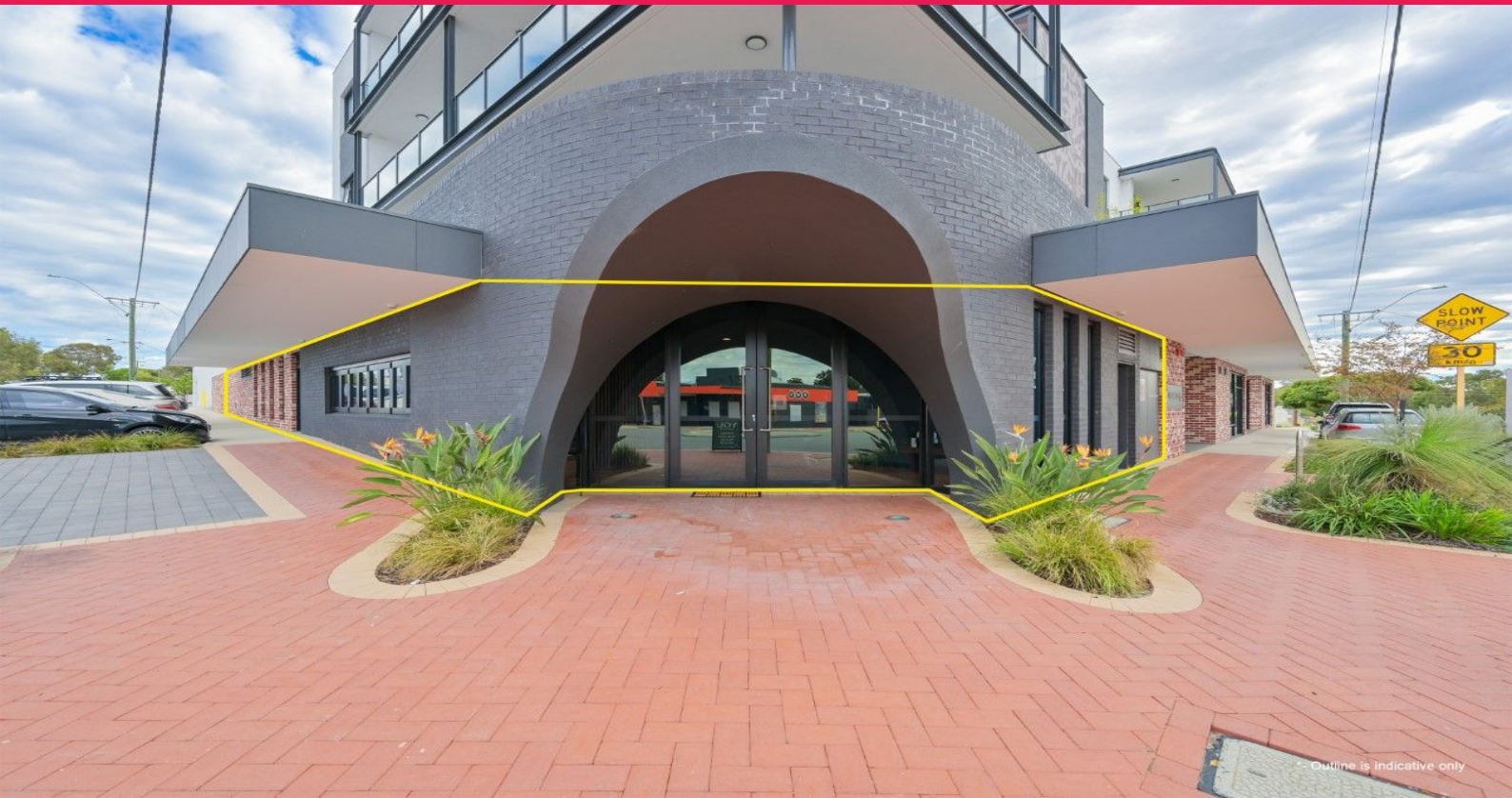
Outline is indicative only