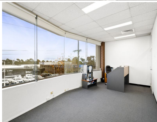
2/1-3 ROOKS ROAD, NUNAWADING