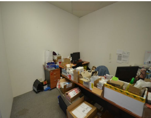
3/297 Great Eastern Highway, Belmont WA 6104