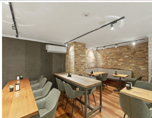
7/672 GLENFERRIE ROAD, HAWTHORN