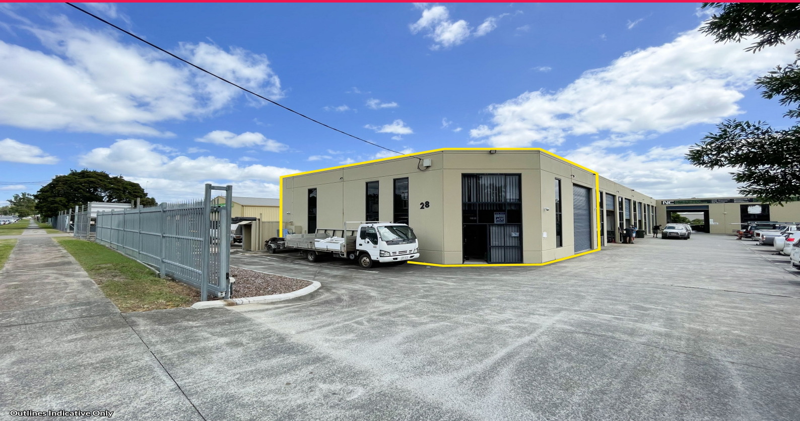
Outlines Indicative Only