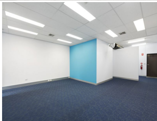
632 QUEENSBERRY STREET, NORTH MELBOURNE