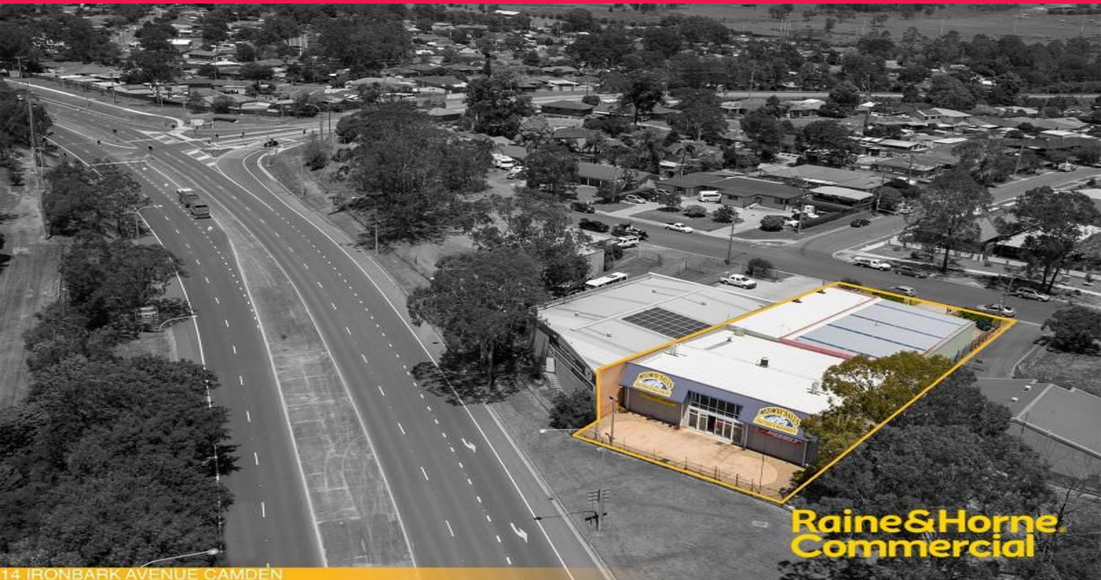
14 IRONBARK AVENUE CAMDEN