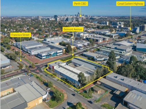
45-47 Belmont Avenue, Belmont WA 6104