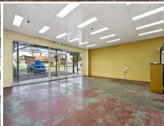
43 ANSLOW STREET, WOODEND