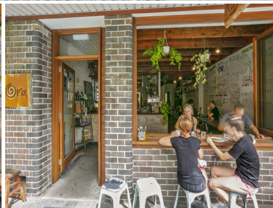
17B Whistler Street, Manly