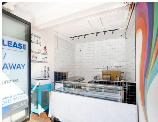
Shop 1 & 2 / 259 Crown Street, SURRY HILLS