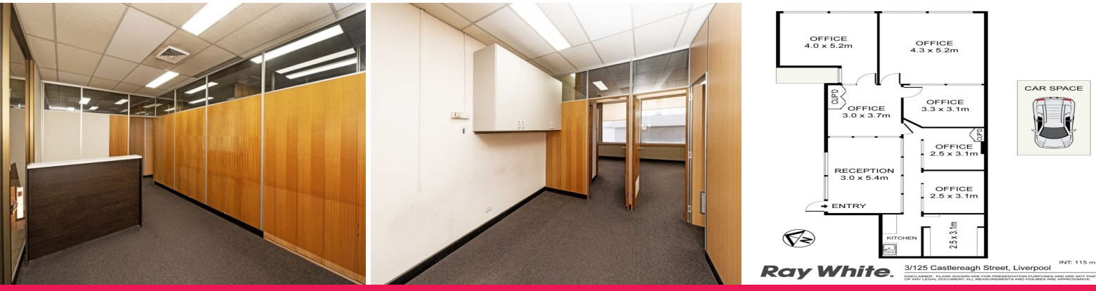
Suite 3, 125 Castlereagh Street, Liverpool NSW 2170