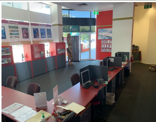
SHOP 1&2 PALM COURT