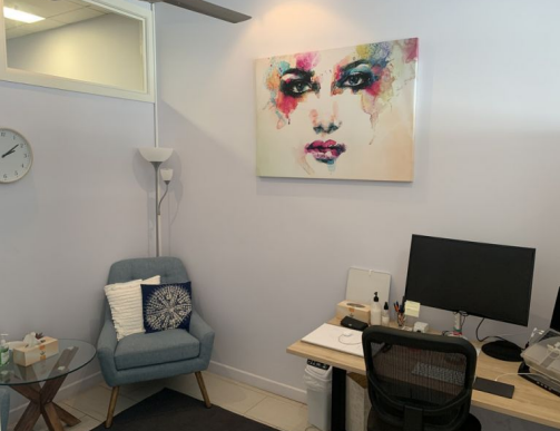
36/5-21 Faculty Close, Smithfield QLD 4878