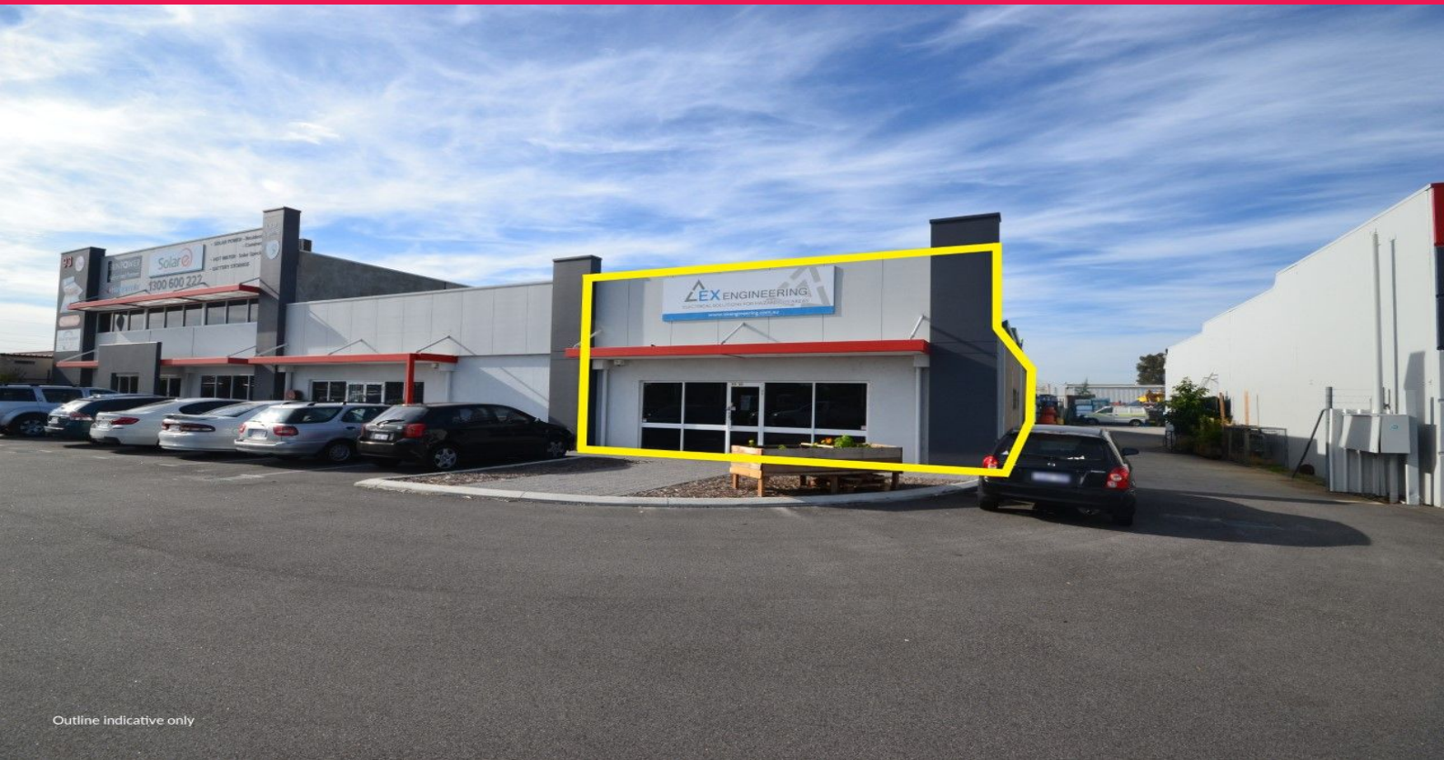
Outline indicative only