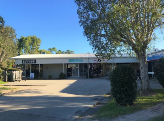
1,2,3/2 Project Avenue, Noosaville QLD 4566