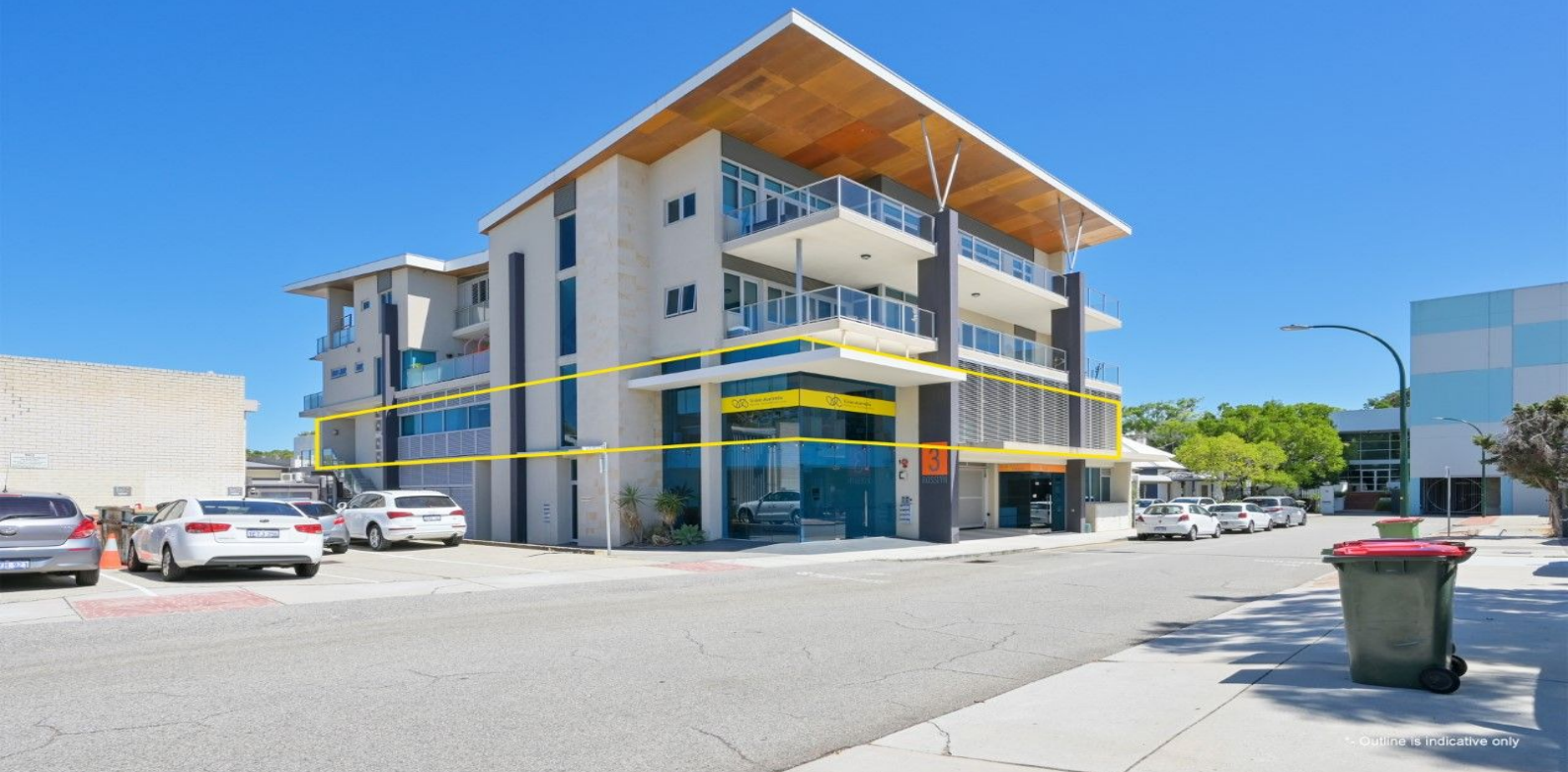
* Outline is indicative only