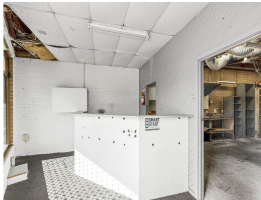
21 ROYTON STREET, BURWOOD EAST