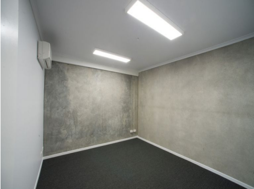
7/1-3 Business Drive, Narangba QLD 4504