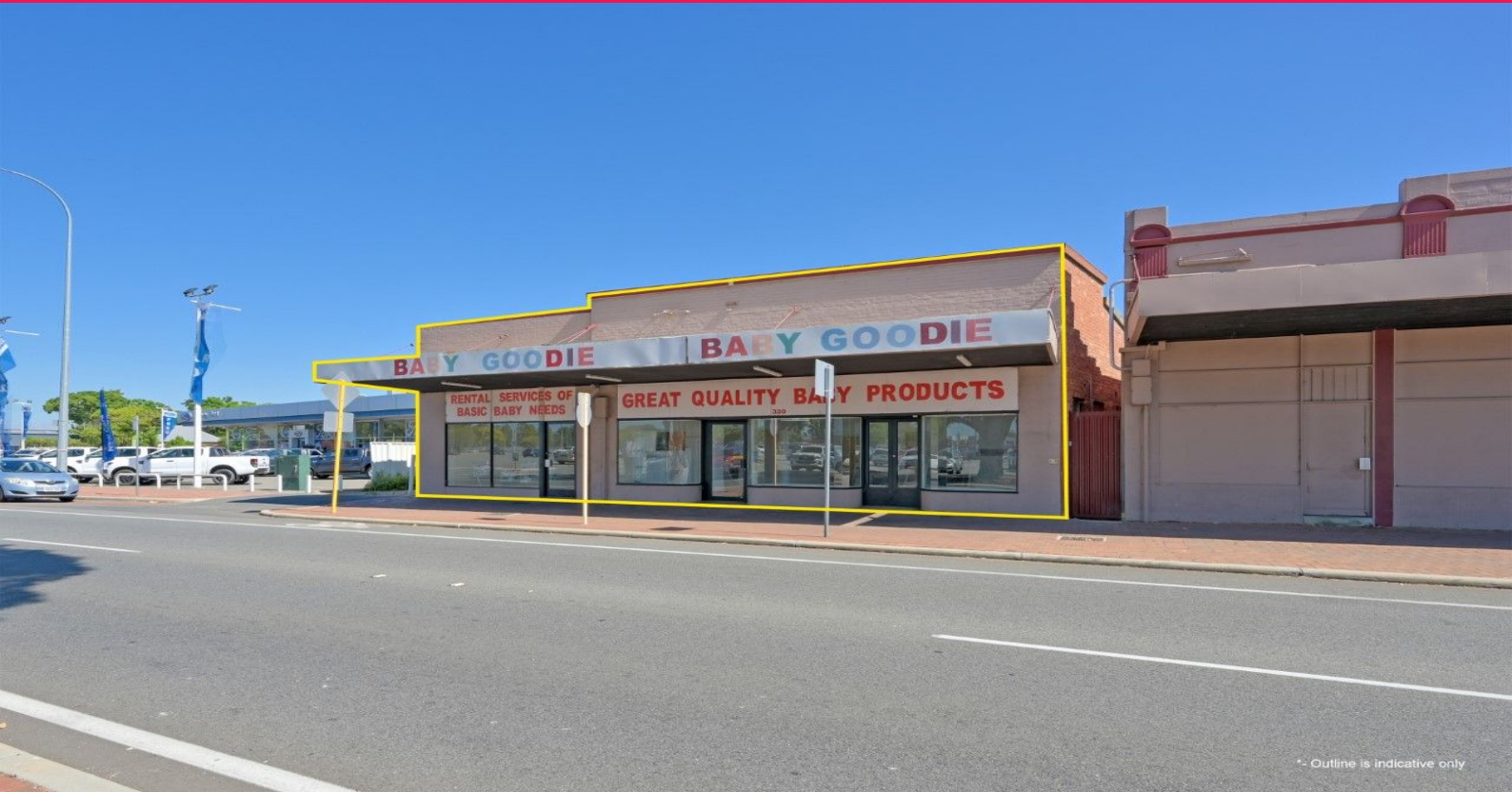
*- Outline is indicative only