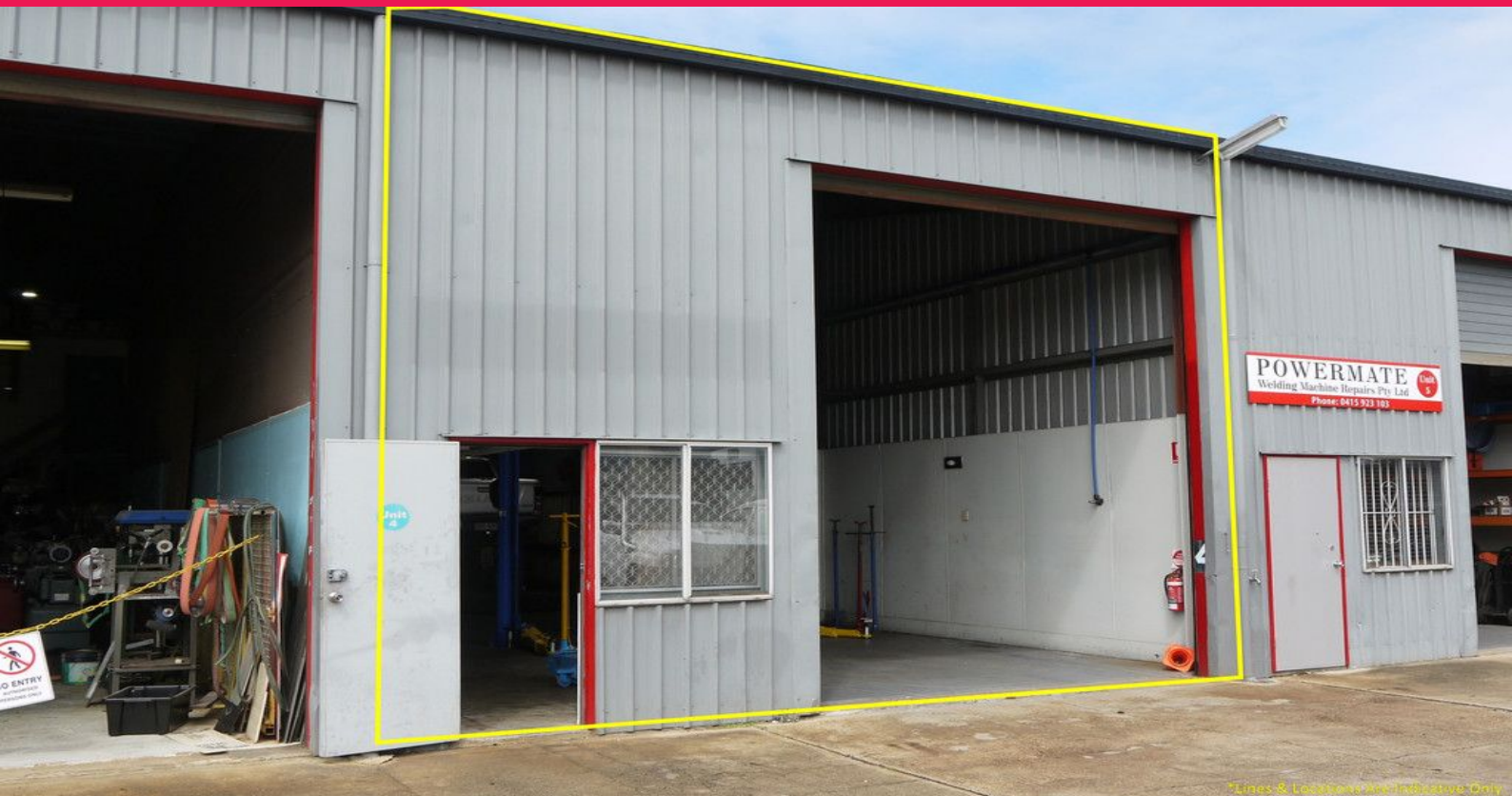
*Lines & Logos are for Illustrative Only