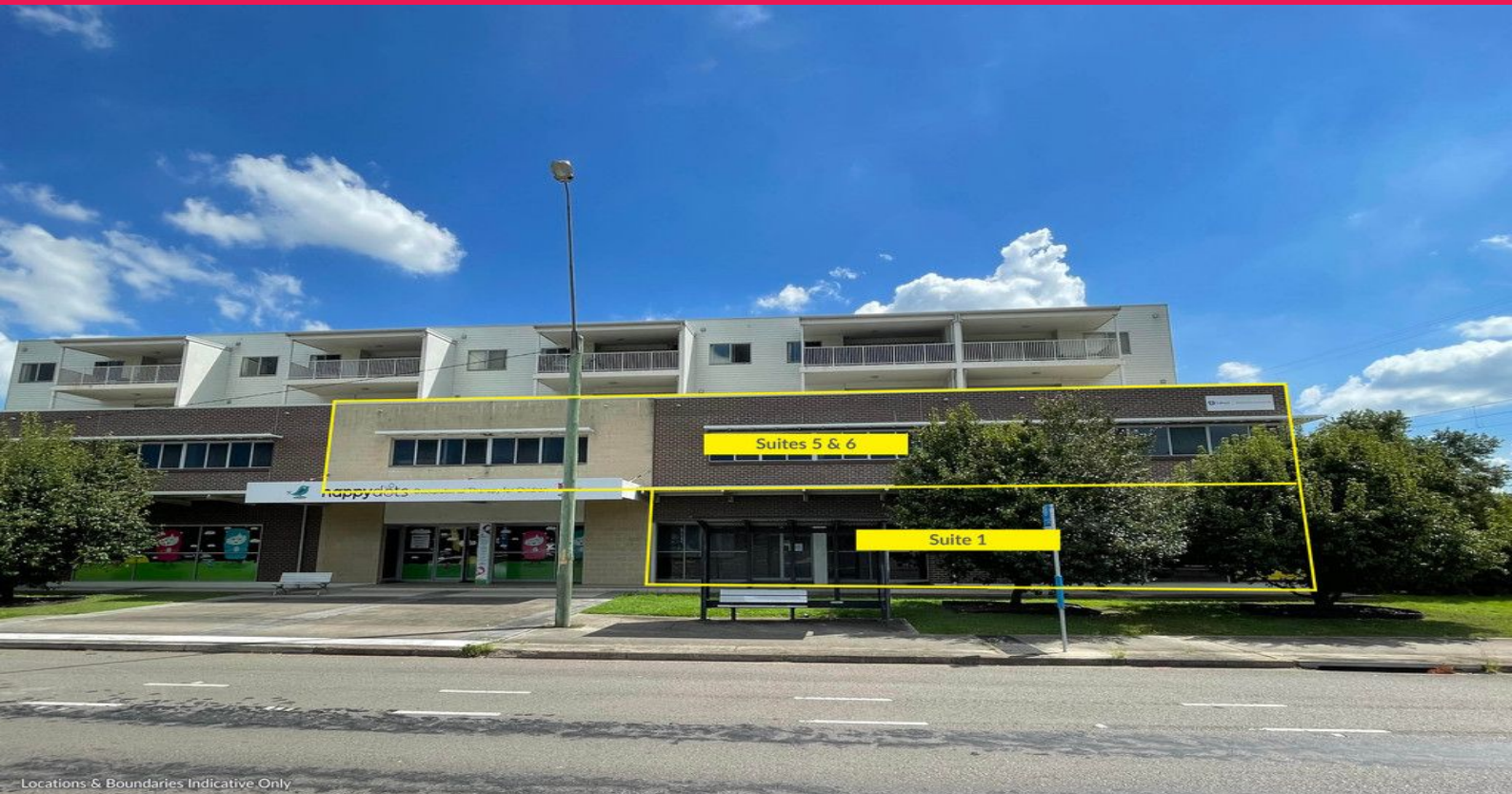
Locations & Boundaries Indicative Only