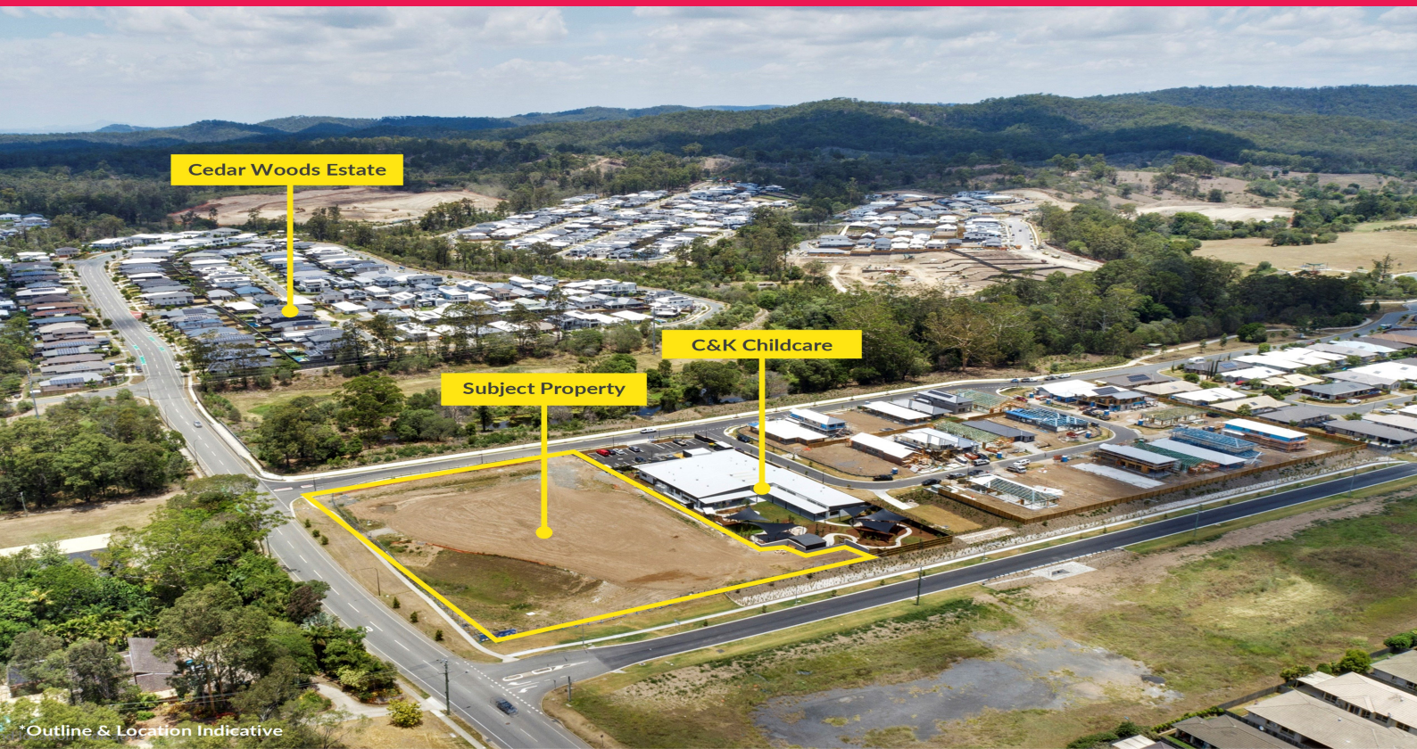
*Outline & Location Indicative