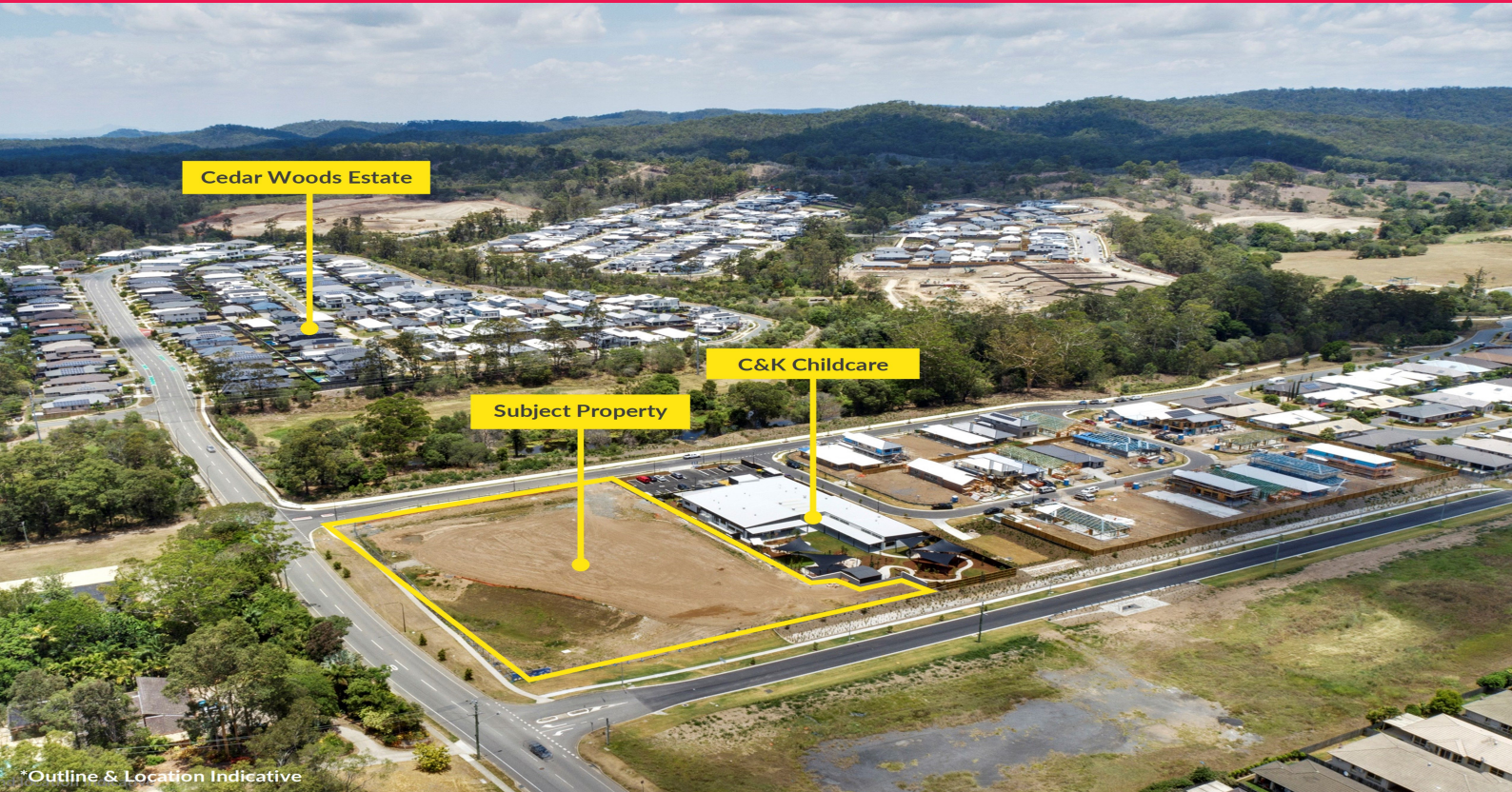
*Outline & Location Indicative