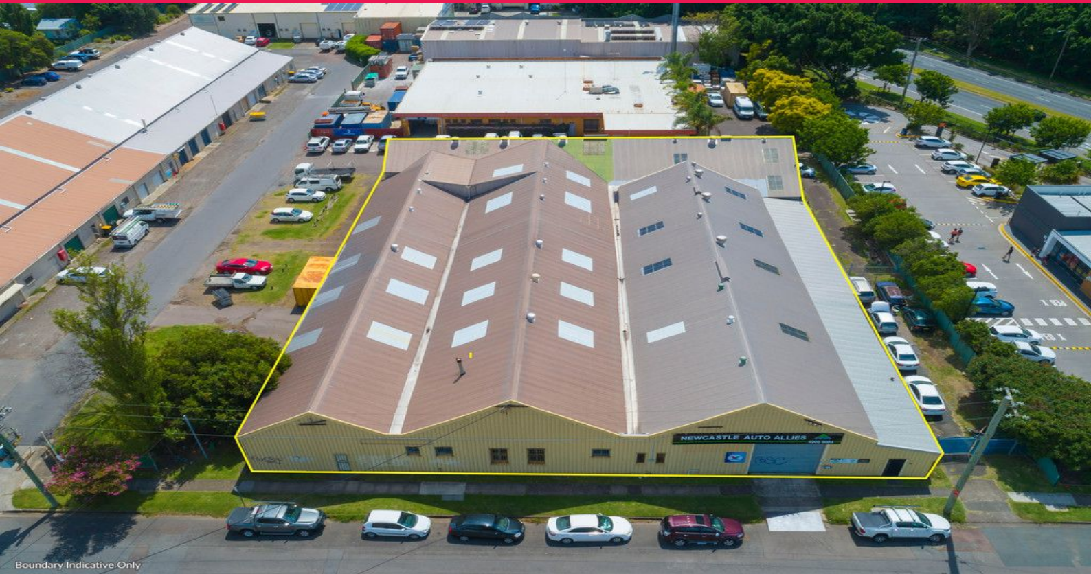
Boundary Indicative Only