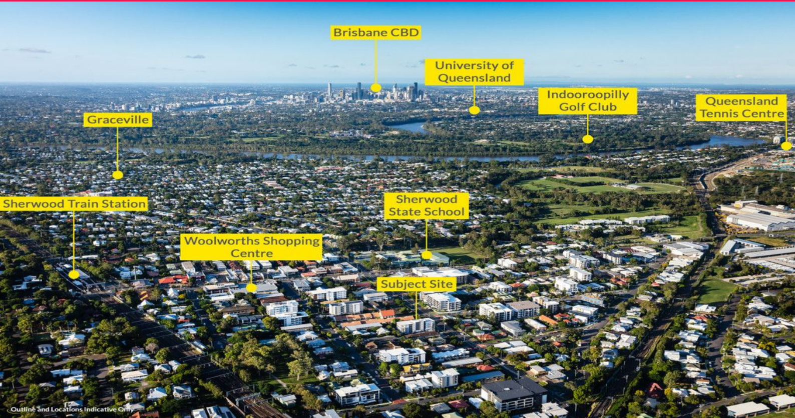
Outline and Locations Indicative Only