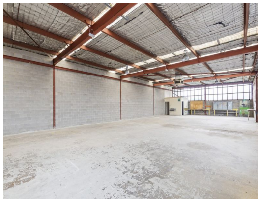
1B/9-12 AIRLIE AVENUE, DANDENONG