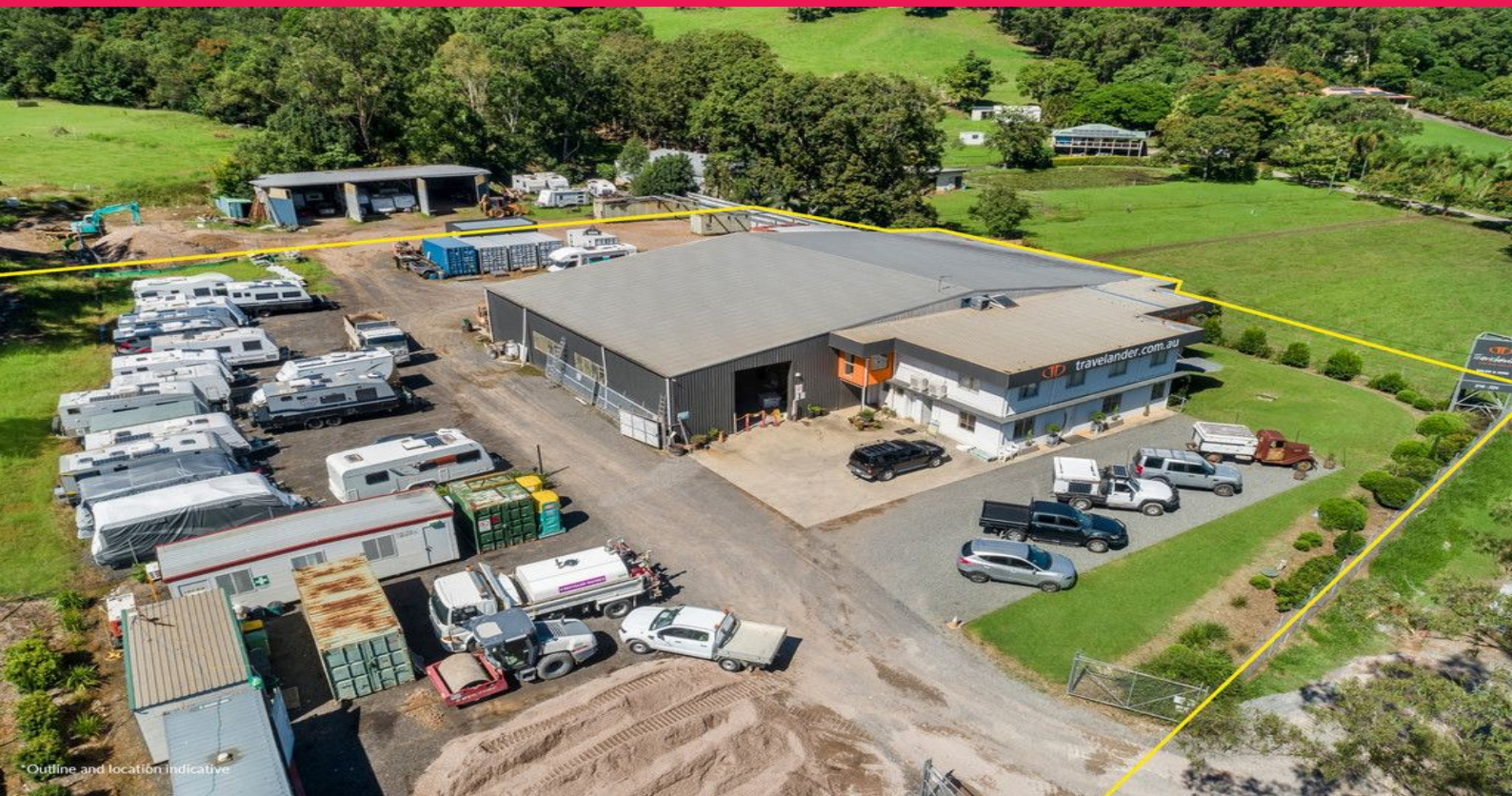
Outline and location indicative